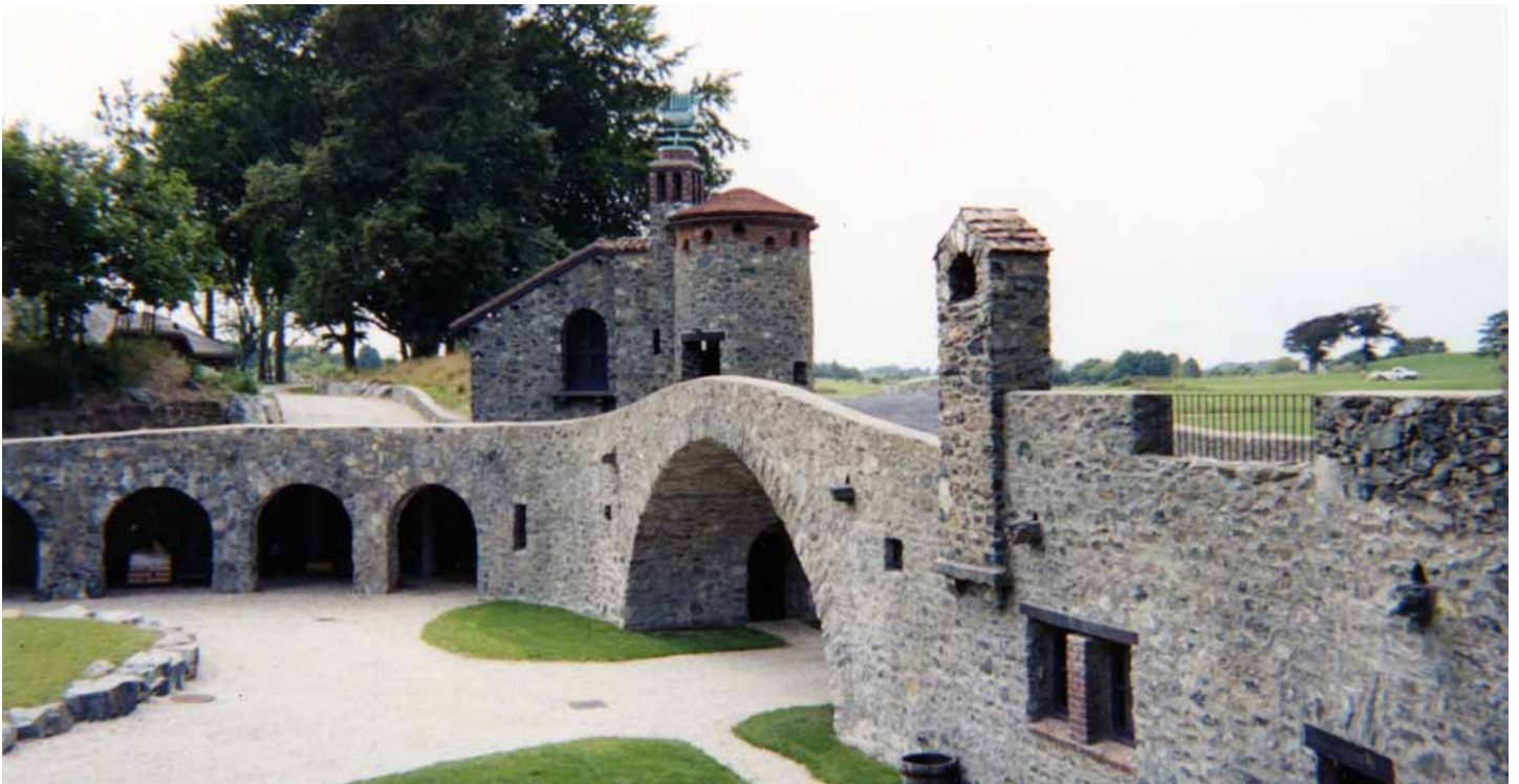
VIEW FROM THE EAST