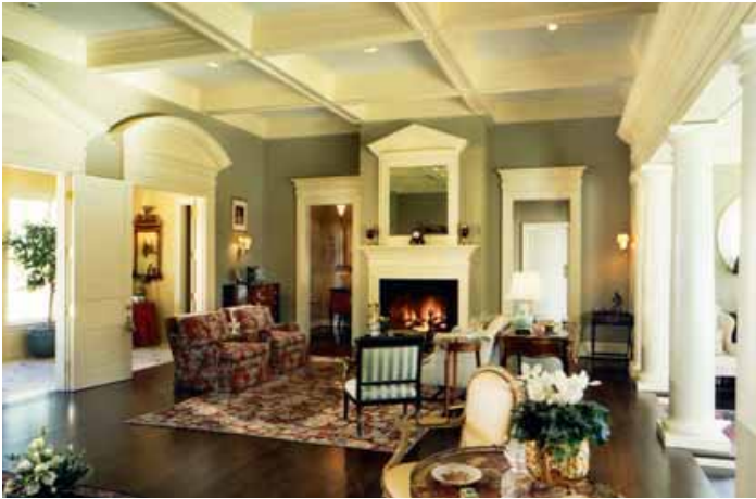
INTERIOR VIEW - FIREPLACE IN GREAT ROOM