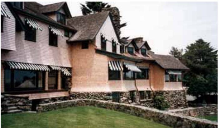
UPPER GARD WALL