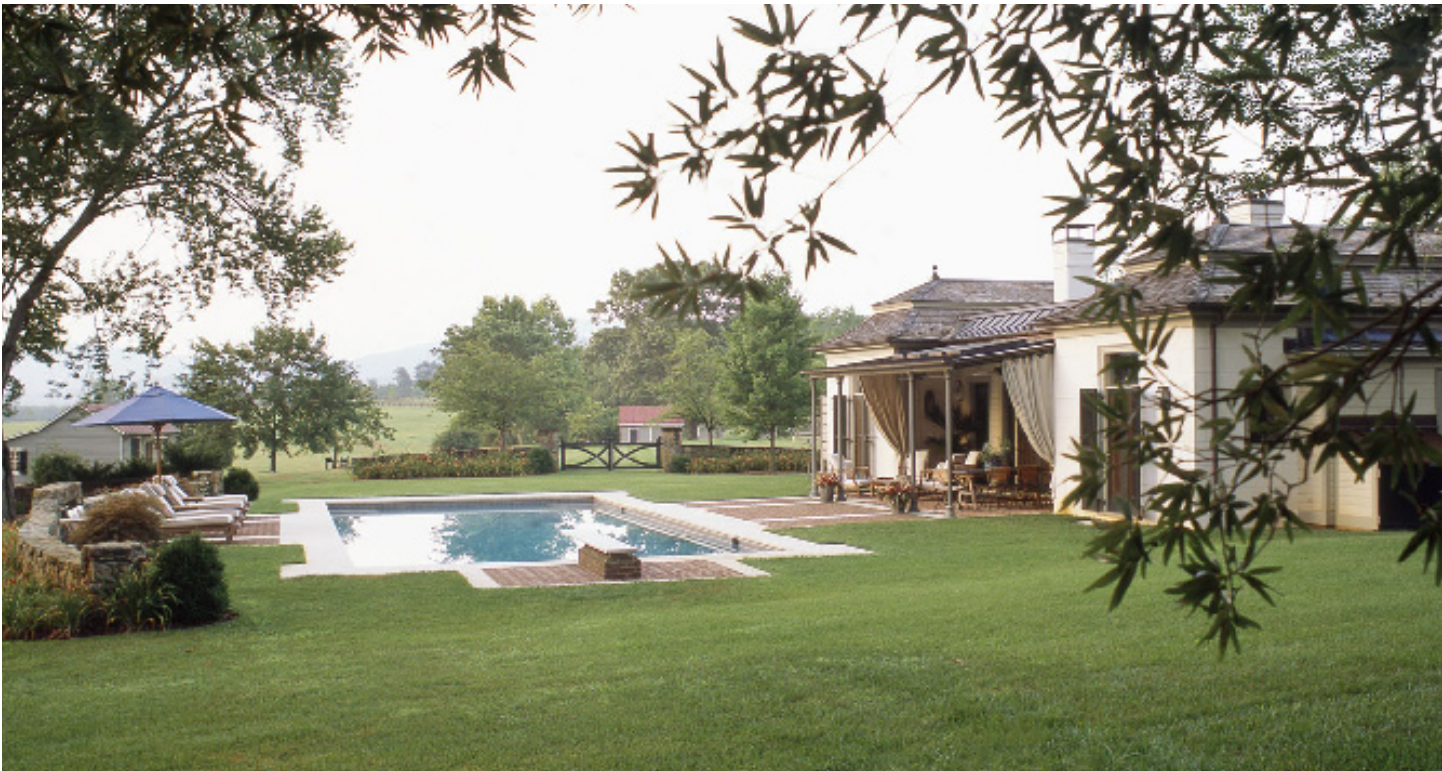
APPROACH TO POOL