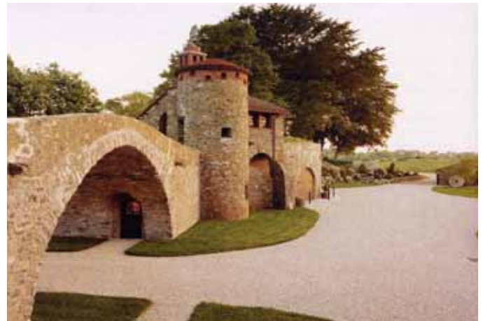
VIEW FROM THE WEST