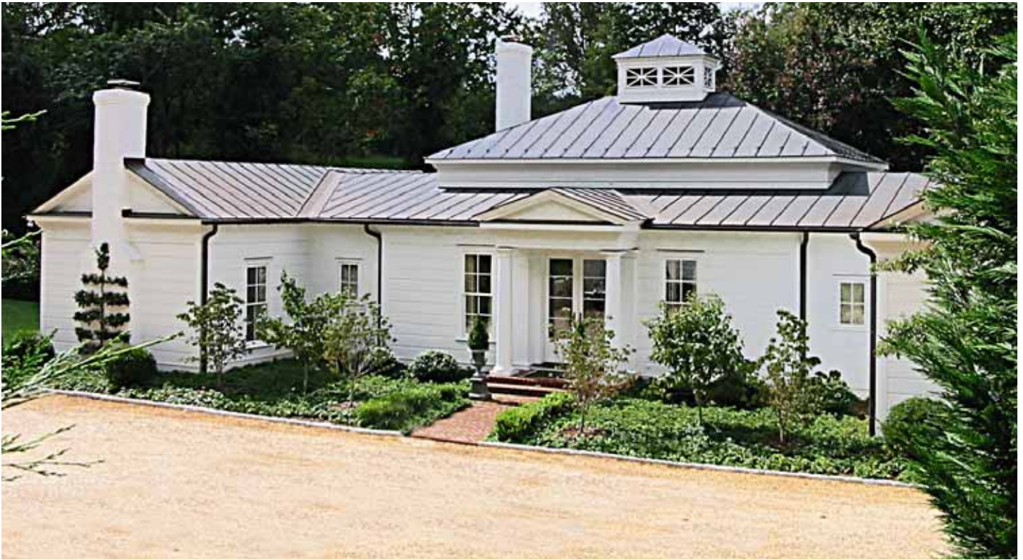
VIEW OF FRONT FACADE