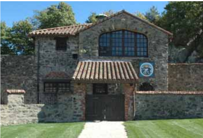
VIEW OF ENTRY