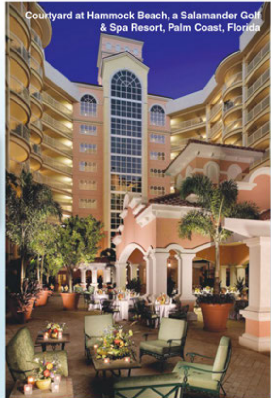
Courtyard at Hammock Beach, a Salamander Golf & Spa Resort, Palm Coast, Florida

Groups with more spare time can take a tour to see how the hotel grows its own orchids for use throughout the property. Including local seafood on catering menus delivers a succulent taste of the Gulf of Mexico, while a toes-in-the-sand reception allows attendees to mingle