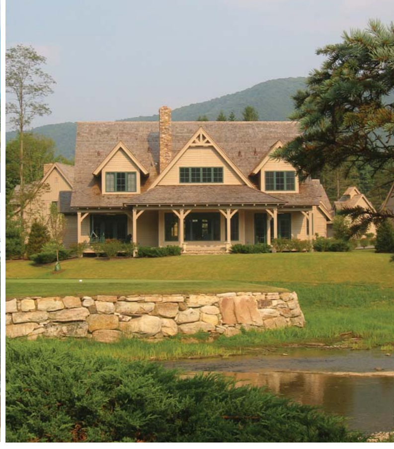
HART HOWERTON Designing Complete Environments™