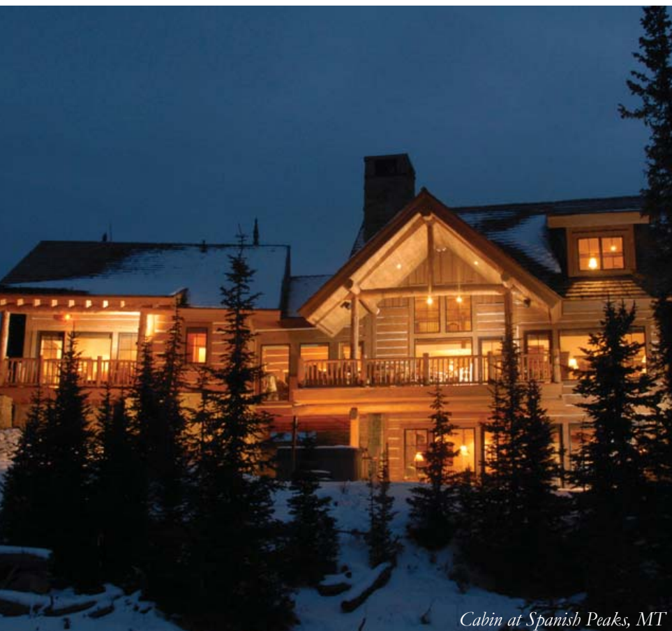
HART HOWERTON Designing Complete Environments™