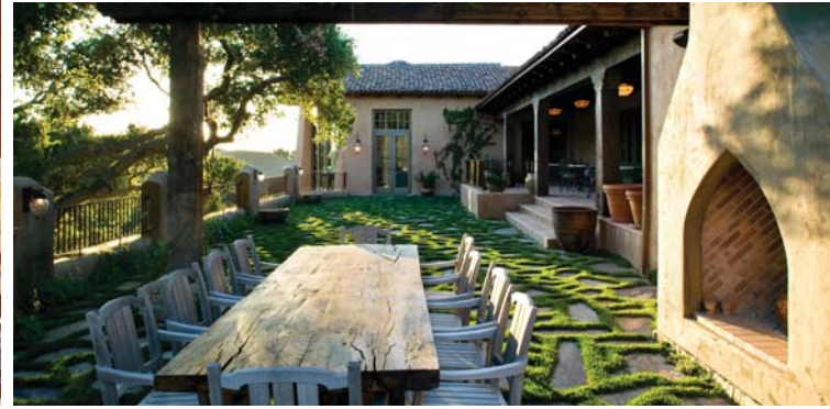
HART HOWERTON Designing Complete Environments™