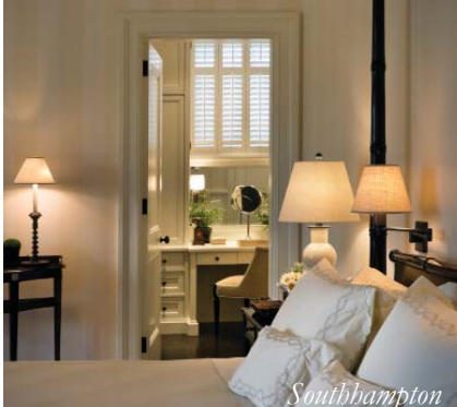
HART HOWERTON Designing Complete Environments™