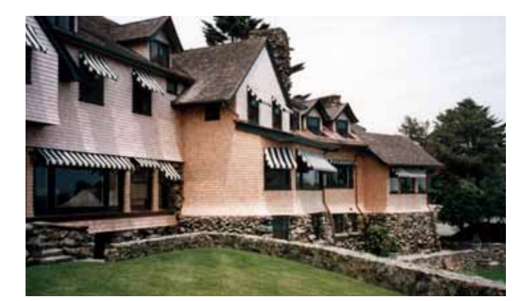
UPPER GARD WALL