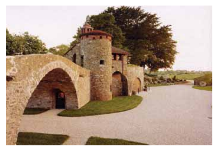
VIEW FROM THE WEST