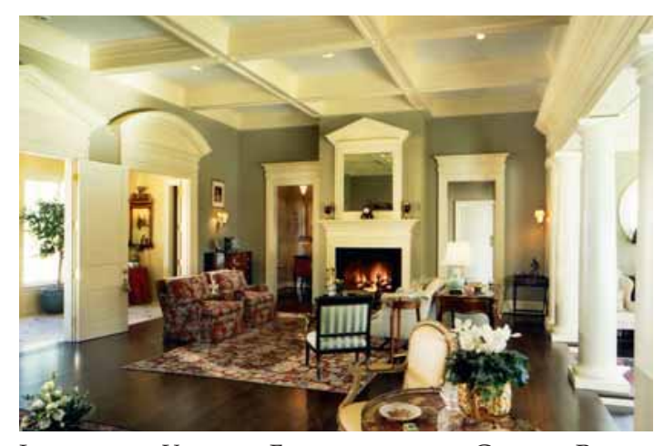
Interior View - Fireplace in Great Room