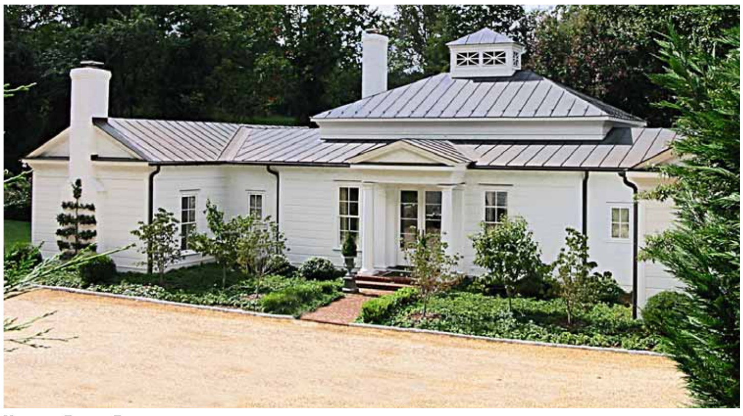
VIEW OF FRONT FACADE