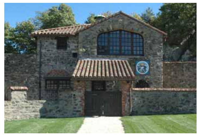
VIEW OF ENTRY