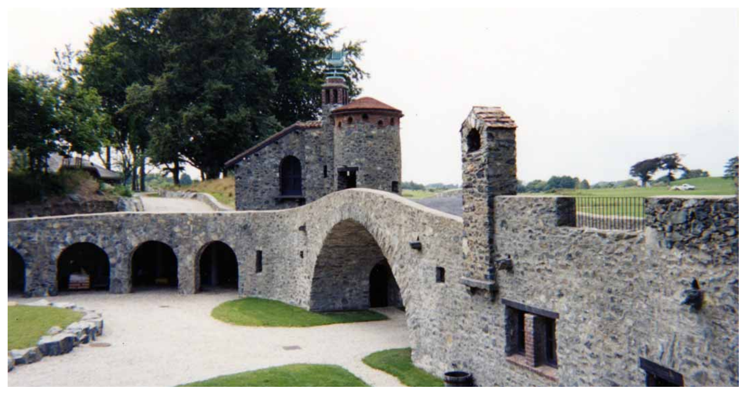
V_{\mbox{\scriptsize IEW}} from the East