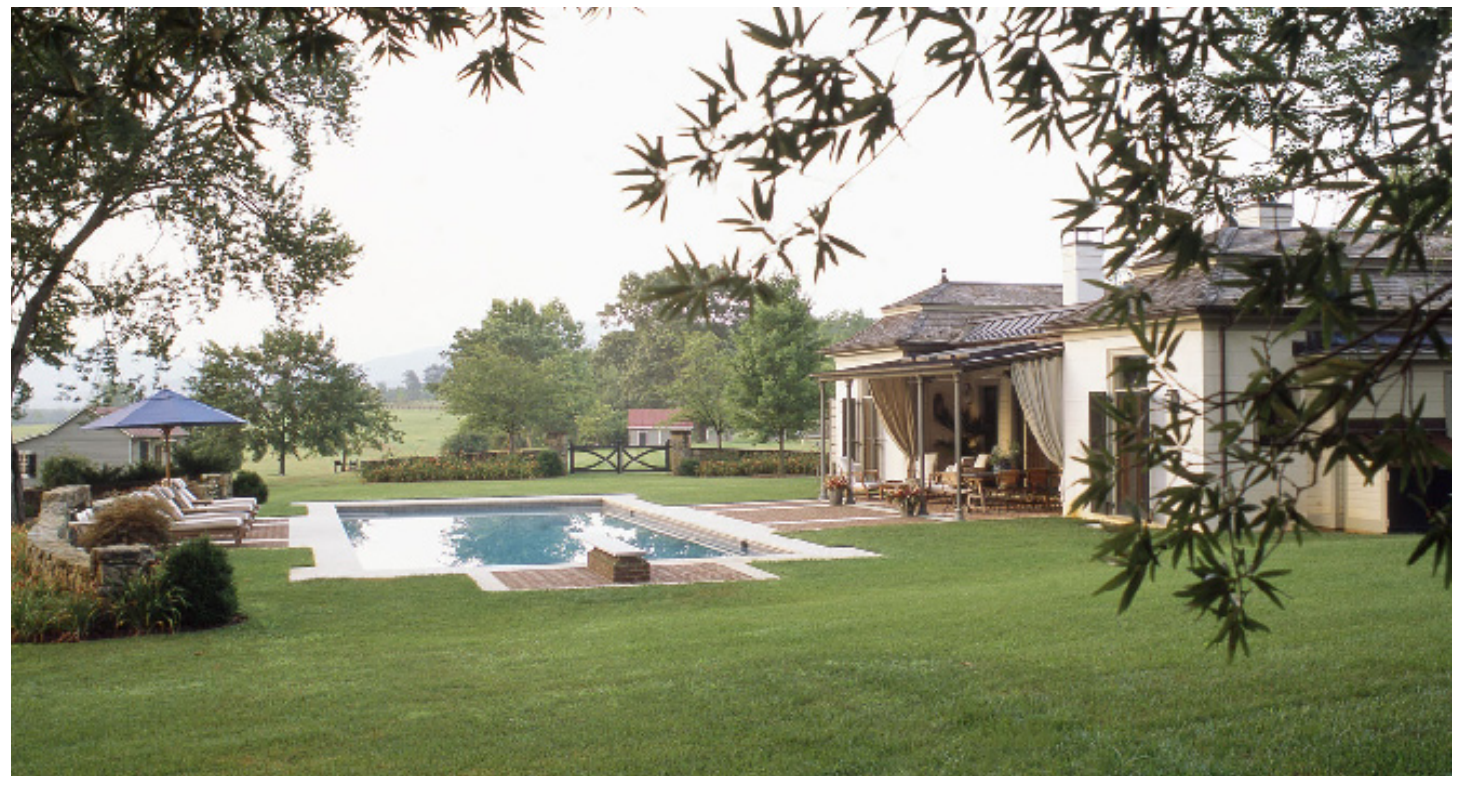
Approach to Pool